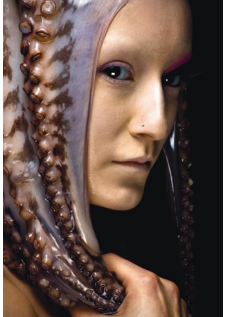
www.councilmag.com • winter 2010 • council magazine 23